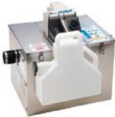
Automatic Grease-Recovery Unit (AGRU)